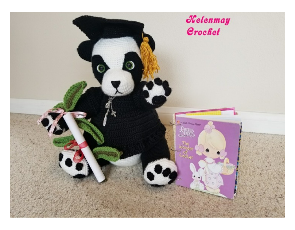
Copying and distribution prohibited. For personal use only.

Copyright 2020 by Helen Brady. All Rights Reserved. This pattern may not be used for purposes of mass production.