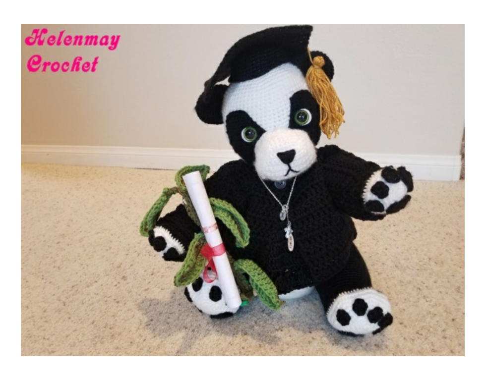
Pattern by Helen Brady

Copying and distribution prohibited. For personal use only. Crochet quick, easy, beginner BONUS graduation gown for your Helenmay Crochet Amigurumi Large Panda Helenmay Crochet You Tube Channel http://tinyurl.com/helenmaycrochet